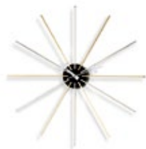
Star Clock, chrome/brass, Ø 610