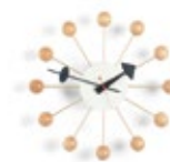
Ball Clock, beech, Ø 330