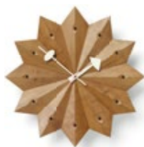
Fan Clock , Kirschbaum, Ø 384