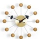
Ball Clock, cherry, Ø 330