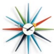
Sunburst Clock, multicoloured, Ø 470