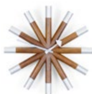
Wheel Clock, walnut/aluminium, Ø 455