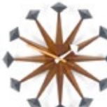
Polygon Clock, walnut, Ø 430