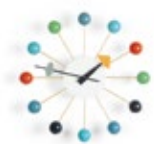
Ball Clock, multicoloured, Ø 330