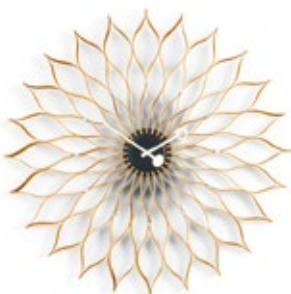
Sunflower Clock, birch, Ø 750