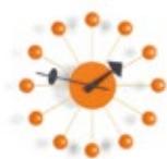
Ball Clock, orange, Ø 330