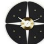
Petal Clock, black/brass, Ø 448