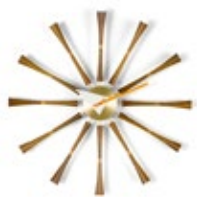
Spindle Clock, aluminium, solid walnut, Ø 577