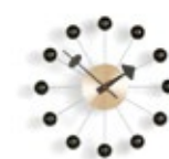
Ball Clock, black/brass, Ø 330