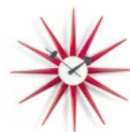
Sunburst Clock, red, Ø 470