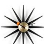
Sunburst Clock, black/brass, Ø 470