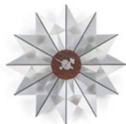
Flock of Butterflies, aluminium, Ø 610