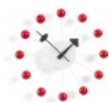
Ball Clock, red, Ø 330