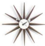
Sunburst Clock, walnut, Ø 470