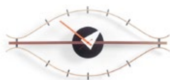
Eye Clock, brass/walnut, H 340 x W 760