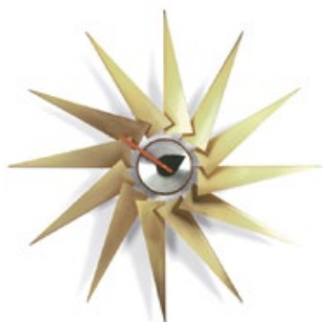
Turbine Clock, brass/aluminium, Ø 765