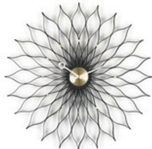
Sunflower Clock, black ash/brass, Ø 750