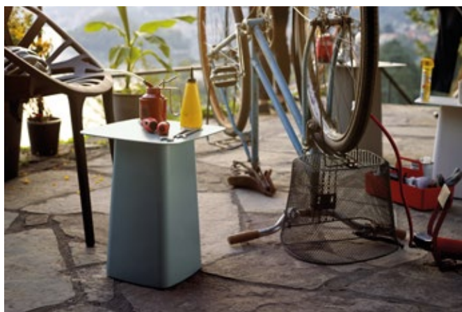
Metal Side Table (Outdoor)

In the powder-coated version with a fine textured finish, the Metal Side Tables serve as weatherproof occasional tables for balcony and garden. The tables make a perfect companion for the indoor-outdoor Waver armchair, which is available with bases in matching colours.