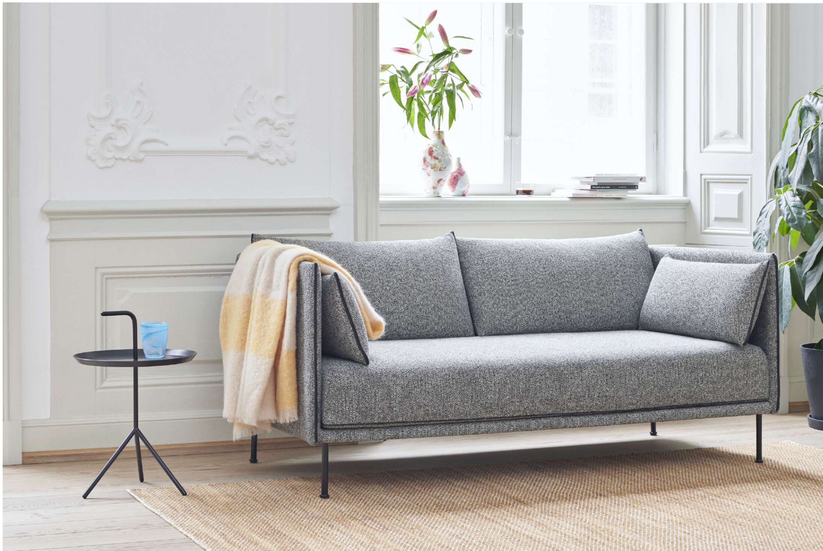
DLM | Black