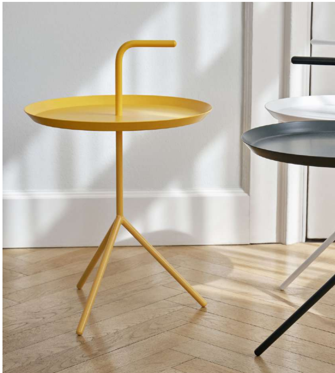
DLM | Sun yellow