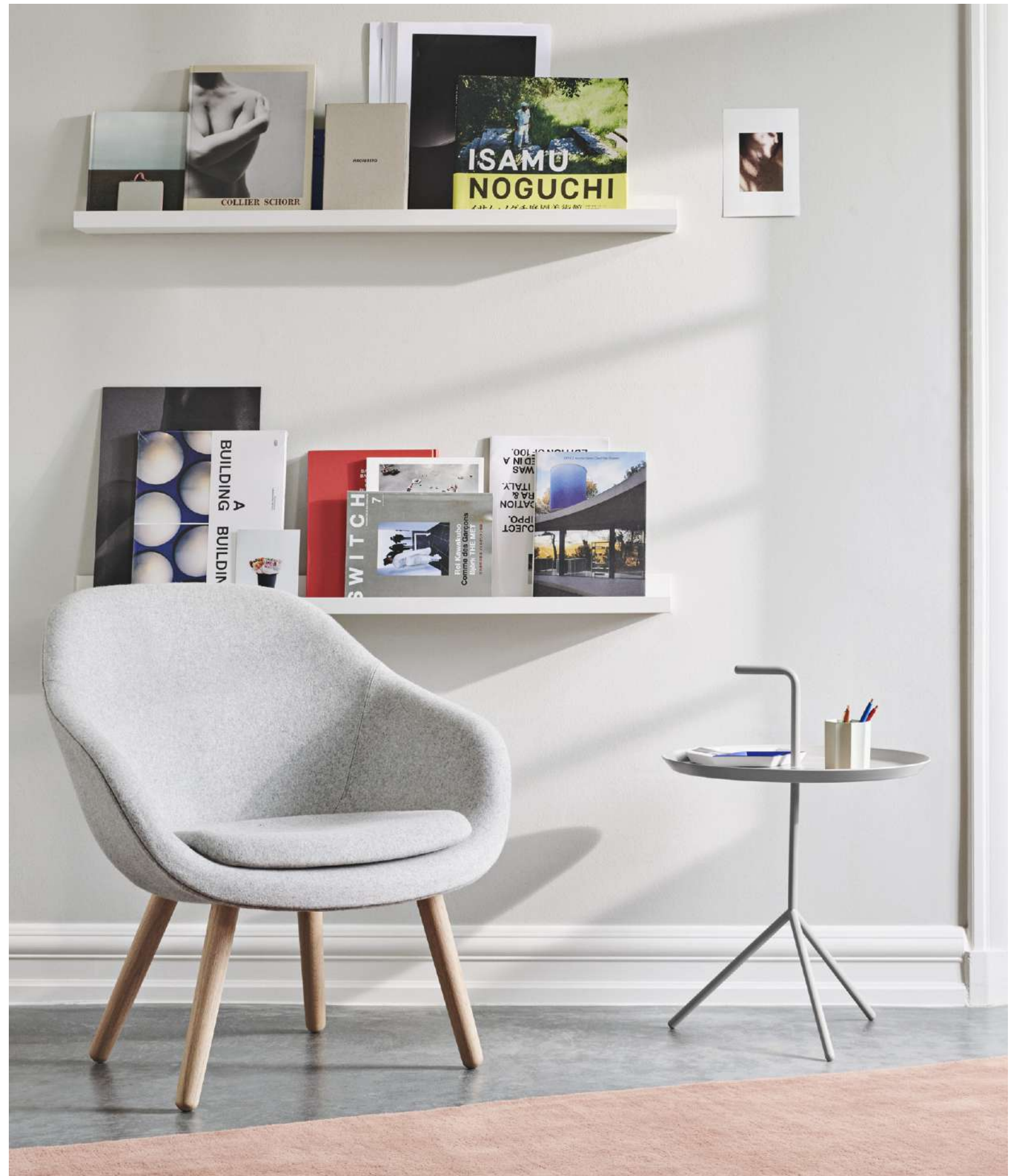
DLM | Grey