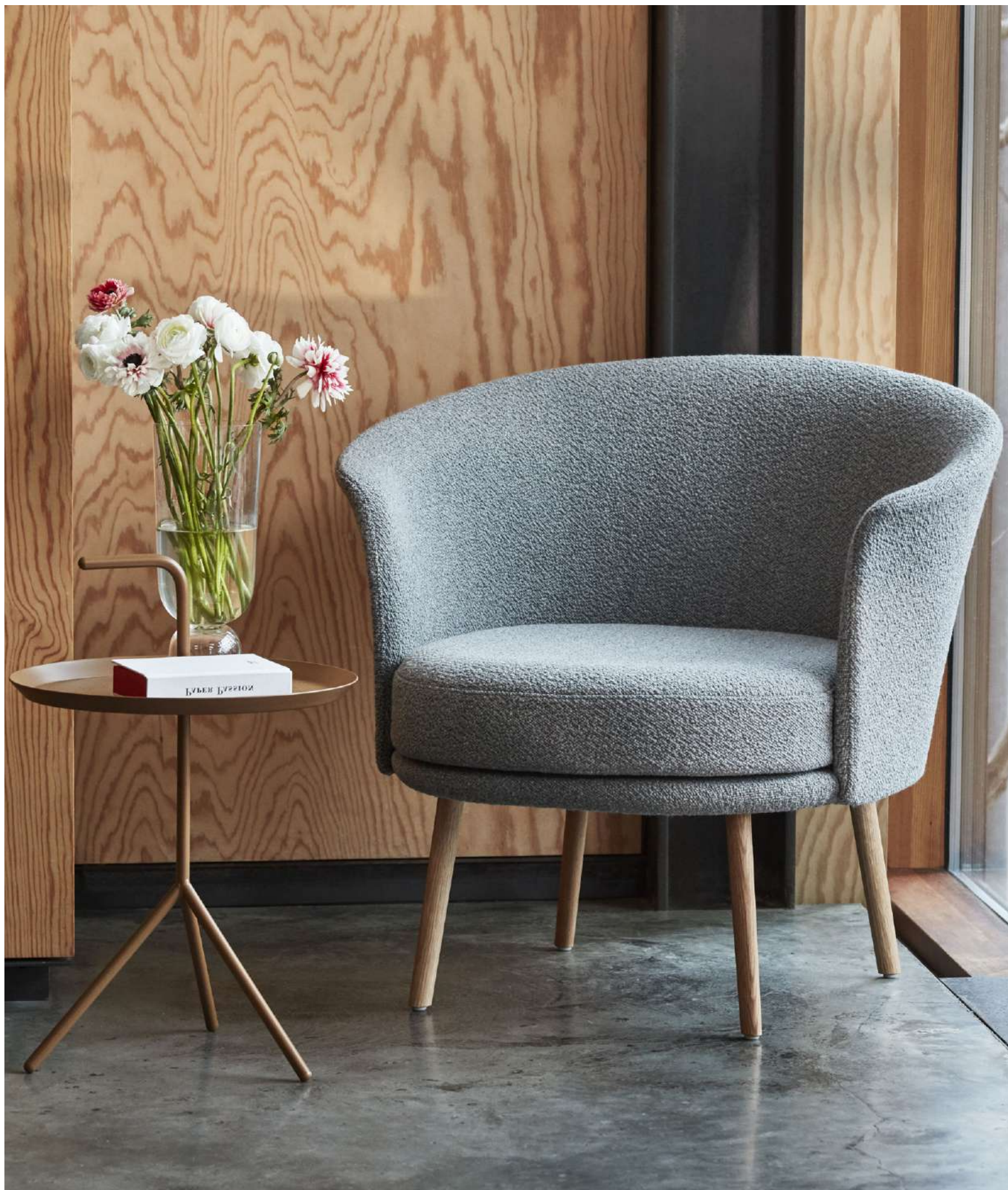
DLM | Toffee