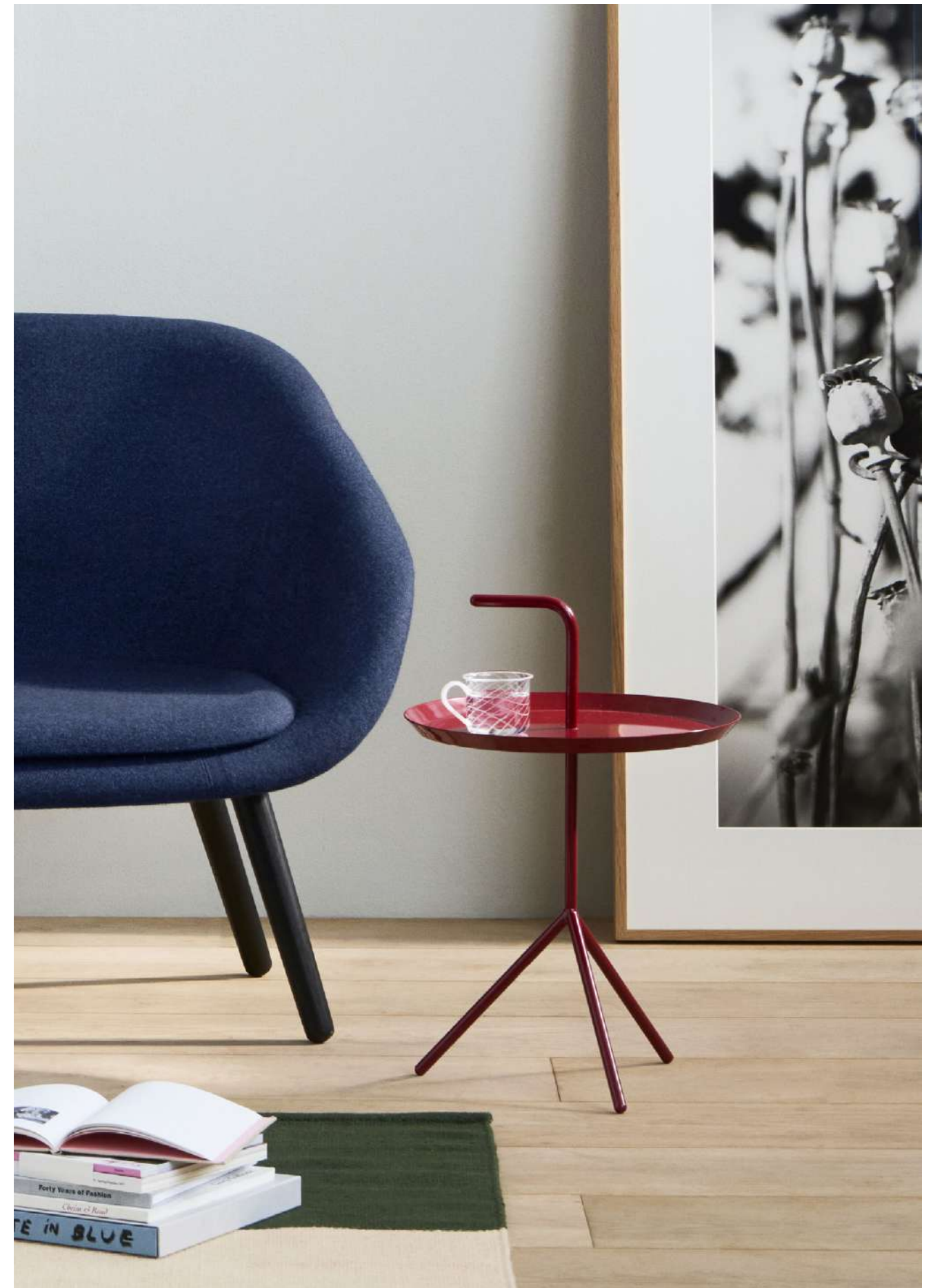
DLM | Cherry red high gloss