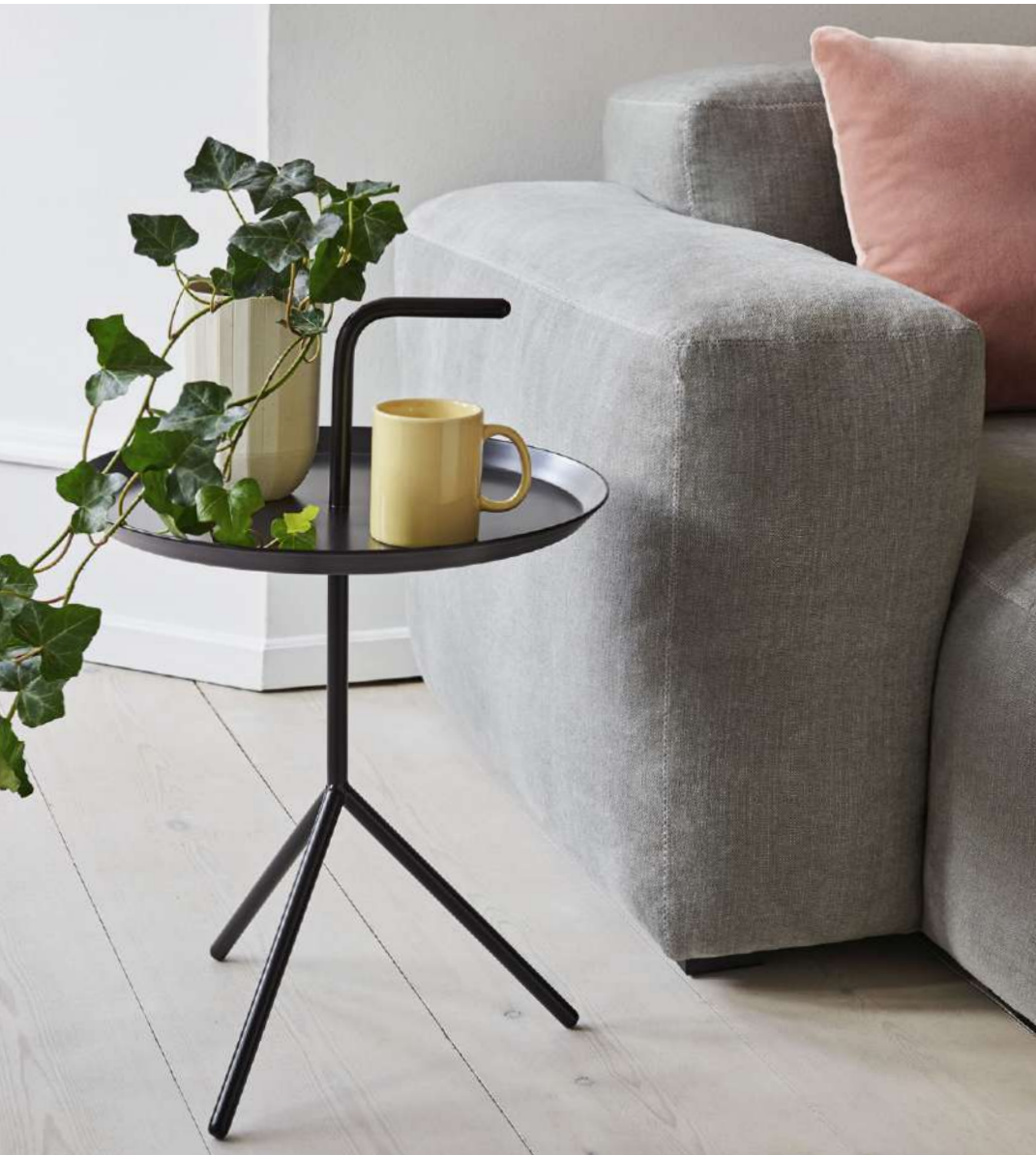
DLM | Black